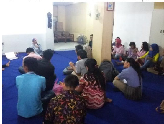
A Visitation to HIV Support Group & Discussion with HIV Counselor